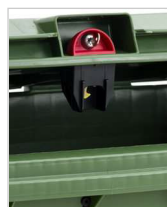
Sudhaus gravity lock