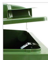
central gravity lock