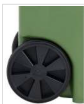
Nose wheel 300 mm