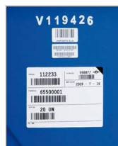
serial numbers customized labels