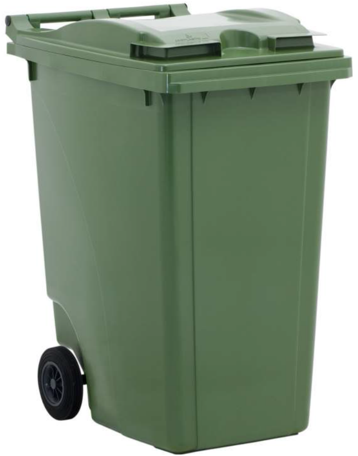
two wheeled bins