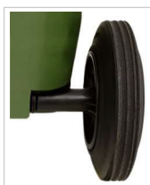
noise reduction application