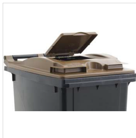
lid on lid version