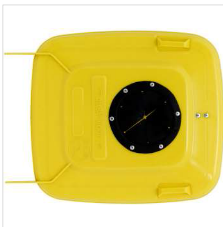
lid for glass/tins