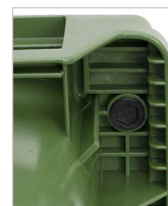
chip nest aperture