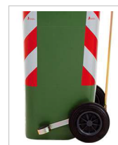
foot pedal lid operation