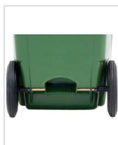
rear kick plate