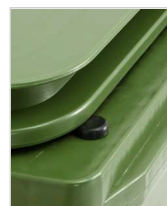
noise reduction application