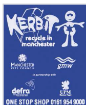
hot foil stamping